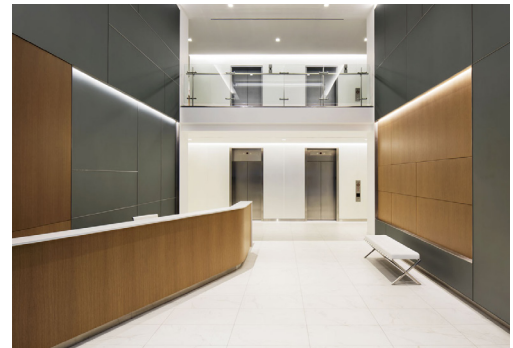
Satin Etched + Back-Painted Wall Cladding