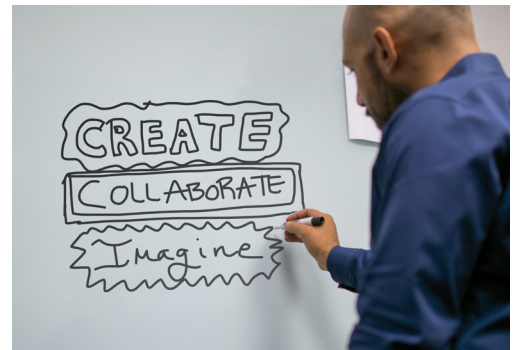
Max™ Glassboard Magnetic