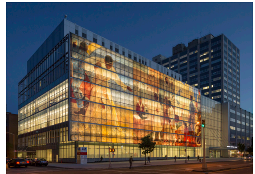
Alice® Design + Low-E Insulating Glass Units

Shower Enclosures - GGI shower enclosures are highly customizable utilizing the vast array of glass types, thicknesses, textures, patterns and designs available; combined with a broad range of hardware styles and finishes.