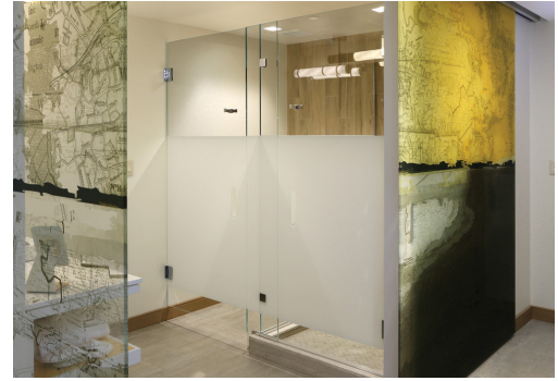
Custom Shower Enclosure + Alice® Design

Project Management - Facilitation of complex, multi-stage custom fabrication projects from design concept to project completion. Our vast range of inventory allows the flexibility of getting what you need, when you need it.