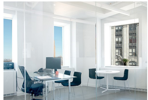
Low Iron Glass Partition Wall