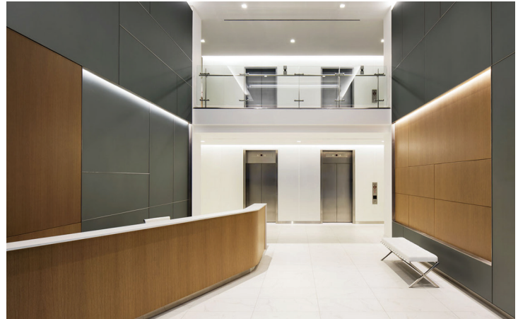
Satin Etched, Low-Iron + Custom Grey Back-Paint