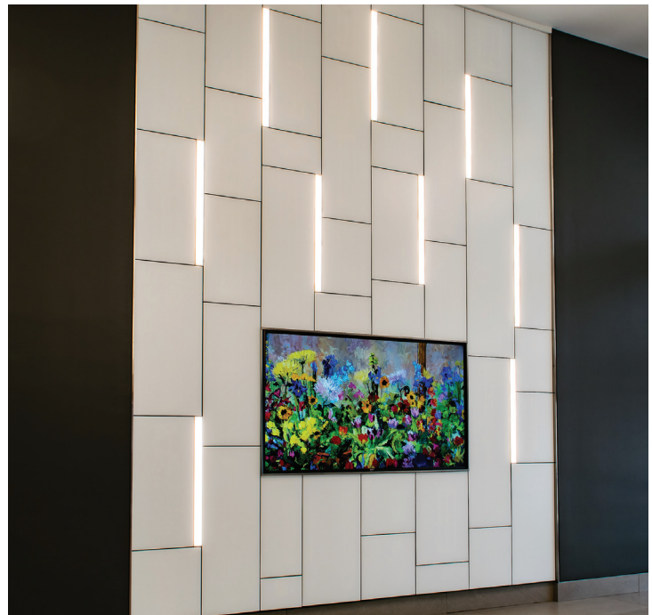
Crystal Light Satin, Low-Iron + Custom White Back-Paint